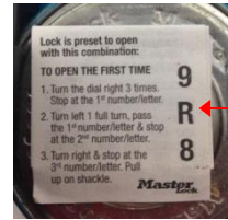
Instruction tag example