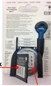
Combination & instructions